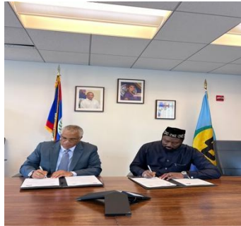
Strengthening relations with Africa, Belize establishes diplomatic relations with the Republic of Gambia.