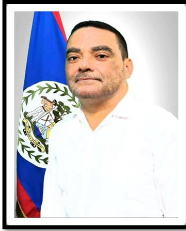
Hon. Francis Fonseca Minister of Foreign Affairs and Foreign Trade

Over the 2023- 2024 period, the Ministry of Foreign Affairs and Foreign Trade (MFA&FT) has had to navigate an increasingly turbulent and divided world.