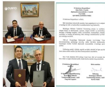
An agreement was reached to activate interactions in searching for mutually beneficial directions of bilateral cooperation. Belize has become the 147th state with which Uzbekistan has established diplomatic relations.