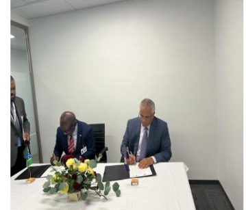
Strengthening relations Belize establishes diplomatic relations with the Solomon Islands.