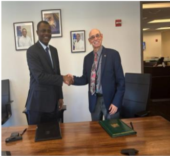
Strengthening relations with the Republic of Benin.